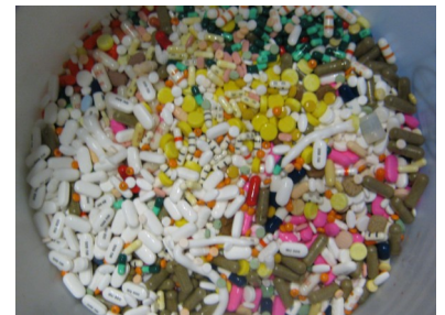
48,092 pills were collected at this round of Prescription Drug Take Backs.

41,000 pills! Fulton had less of a turn out than their June Take Back, but still received close to 400 pills. The following week Miller County Cares held an Rx Take Back in Eldon, Iberia, and Lake Ozark. They collected a total of 4900 pills and various other liquids, patches and vials. Finally, Montgomery County in partnership with the MU Extension and MCCHIP held their event on November 16. They collected a total of 1792 pills! That is a grand total of 48,092 pills, 50-60 pounds of medications, and 25 other prescriptions!!! GREAT JOB CENTRAL REGION!