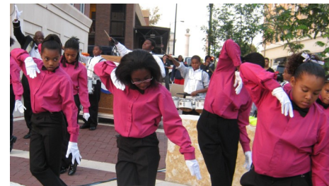
The Missouri Highsteppers drill team and drumline are known for their crisp, high energy routines requiring discipline and practice. Youth were a vital part of the 100 Best Communities ceremony.