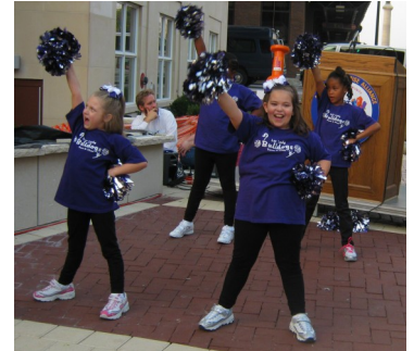
The Little Lady Bulldogs perform at America's 100 Best Communities ceremony. YC2 realized their goal of receiving the award in just 4 years, a year ahead of schedule.

columbiamissourian.com/stories/2010/10/12/columbia-one-best-100-communities-young-people/