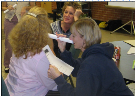
Mental Health First Aid participants simulate auditory hallucinations to develop a better understanding of mental illness.