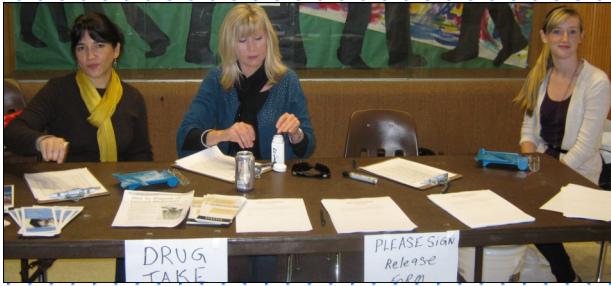
Volunteers help out at the Boone County Prescription Drug Take back at Hickman High School.