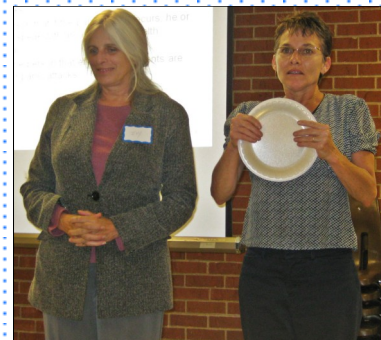
Mental Health First Aid participants demonstrate a panic attack scenario. 23 people were recently certified.